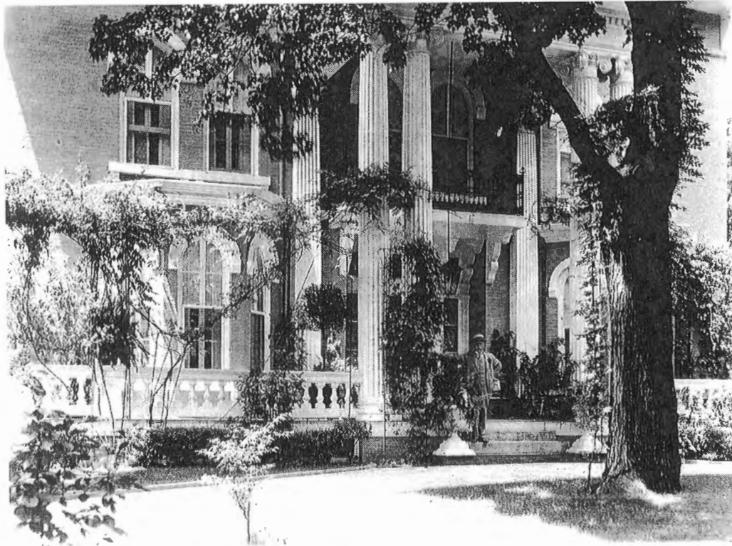
Ionic columns and large bay windows graced the Bryn Mawr mansion, which housed Our Lady of Mercy School. Photo from the 1920s, courtesy of the Granville Historical Society.

With the coming of World War II and a return to prosperity as well as a request from Bishop Hartley, the sisters looked back to their original purpose. In their brochure of 1931, they had proclaimed that they intended "to give individual assistance to girls who are retarded in their studies, or who, because of delicate health or some such reason, cannot apply themselves to a full school schedule." It was decided the school