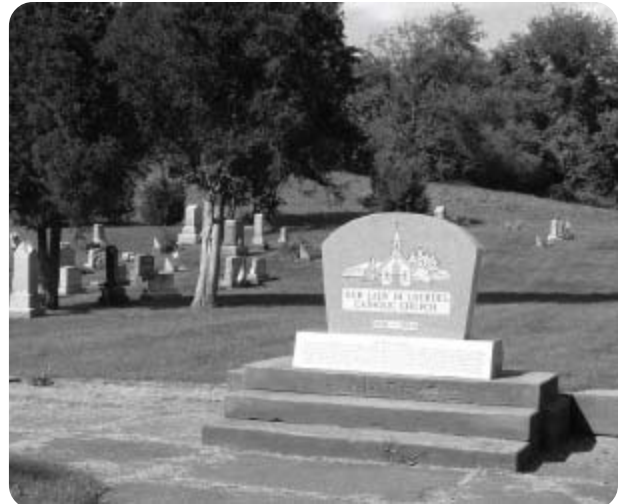
Memorial marker atop the church steps of Our Lady of Lourdes, 2006