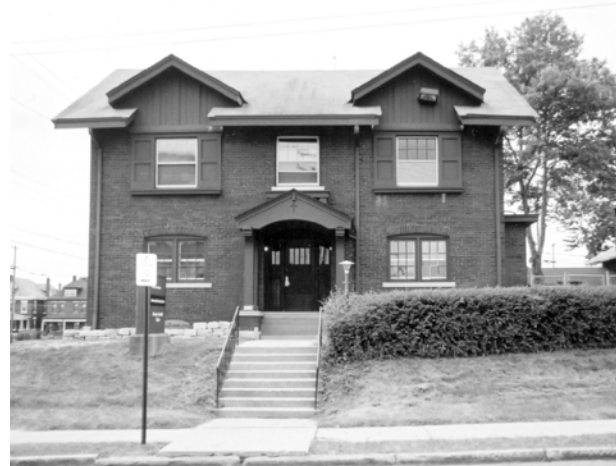
St. Cyprian convent, on Hawthorne Avenue

Perhaps there are a very few residents that now can tell the story of the three brick buildings on the south side of Hawthorne Ave., across from the hospital grounds. The first, 1413 Hawthorne Ave., is still proud and cared for. The second at 1407, and the third at 1405, need care and seem to stand empty. All are now the property of Ohio State Medical Center...but...their story needs to be remembered.