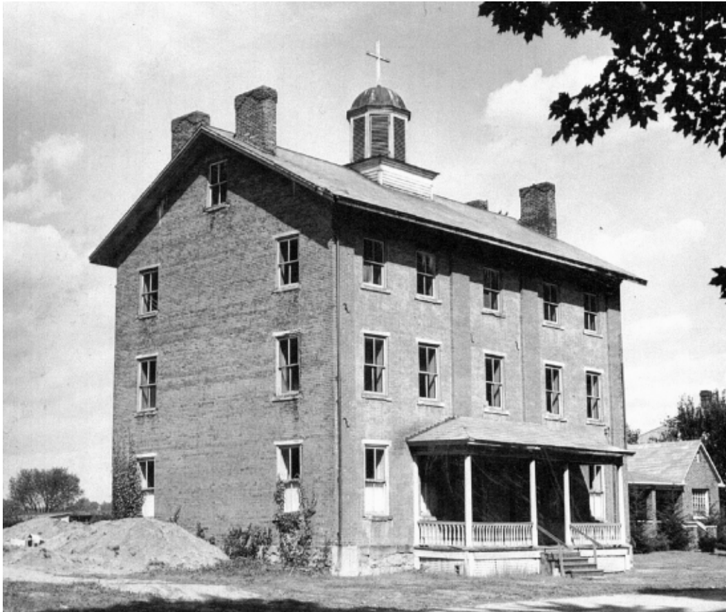
The first St. Bernard's Church in Beverly